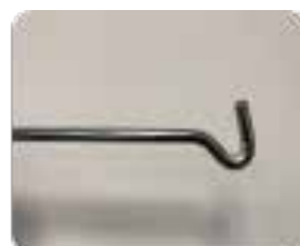
Additional Chrome Support