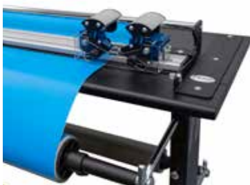
Cutting system (RH / Easy cut 165)