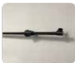
Additional Roll Holder