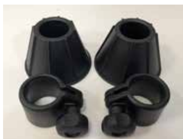
Couple of cones and hold rings